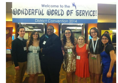
Our Key Clubs at the DCON